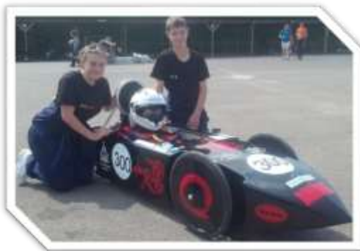
Team Dark Horse

On Sunday 10 th June students from Wadham school and Maiden Beech Academy took part in the Greenpower car race heats at Goodwood Motor circuit. The race heats were for the 2018 Greenpower Car IET Formula 24 Championships. This has been a joint project with Maiden Beech Academy and St Bartholomew's Church. During the year students took part in a number of workshops at Maiden Beech where they designed and modified two electric kit cars that were built during the 2016/17 academic year. This year the students named the cars 'Dark Horse' and 'King Cobra'