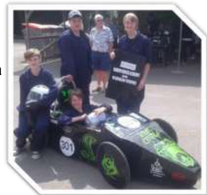
Team King Cobra

74 cars from schools and colleges across the UK, competed in two 90-minute race heats with the winning team being the car that travelled the furthest distance in the 90 minutes. At least three people from each team had to drive the cars during each race, so pit changes were an essential part of the race. This was the second year that we have taken part in this competition.