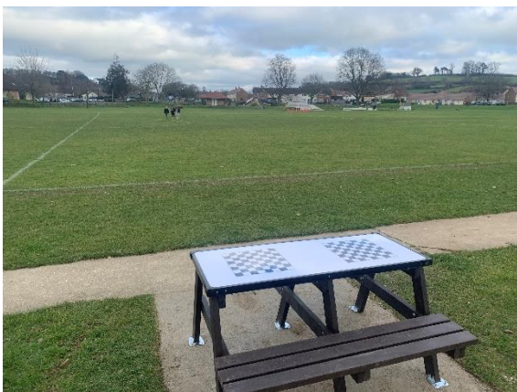
Outdoor chess table