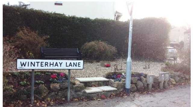
Burma Star Garden rejuvenated