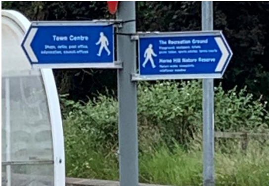
New finger boards