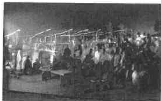
A pedal-power film being shown in Malawi